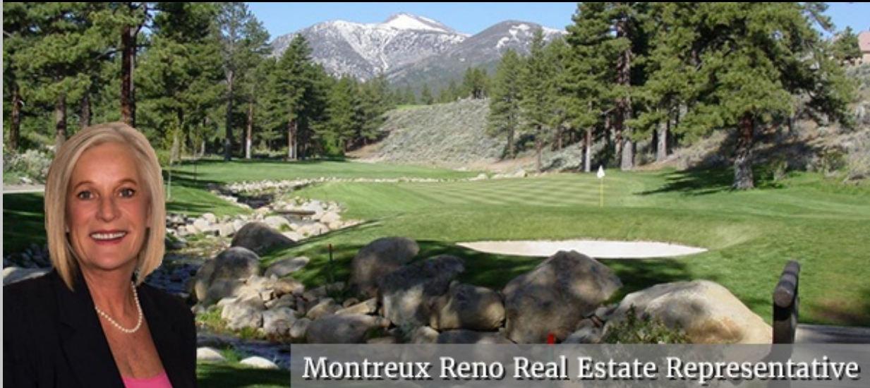
Montreux Reno Real Estate Representative