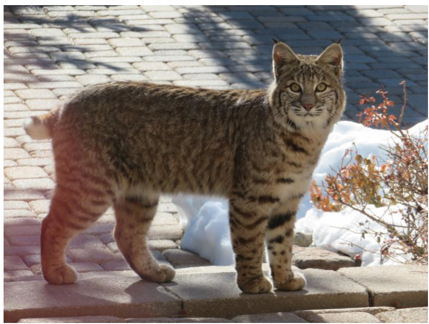
A Beautiful Bobcat seen in Montreux