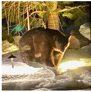
Montreux bear not hibernating yet!