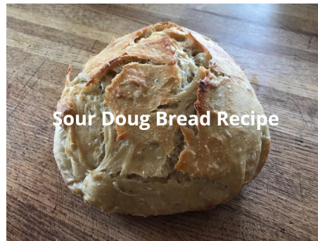
Sour Doug Bread Recipe...Easy