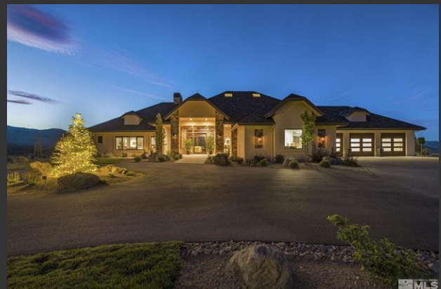
St James Village Gated Community