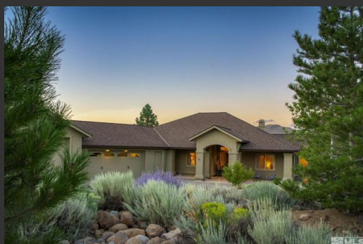
St. James 204 Paddington Court Price: $1,458,900 SOLD