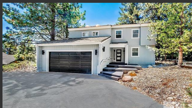
Galena Forest 455 Blue Spruce Rd $1,595,000