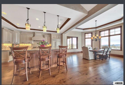
20162 Bordeaux Drive SOLD $2,295,000

Spectacular estate on the 6th fairway of the famed Montreux Nicklaus Signature golf course, boasting 5 BD's/5.5 baths, a custom masterpiece w/ detached casita. Magical courtyard welcomes you to a breathtaking entrance surrounded by plush landscape. Exquisite interior finishes including, high-end appliances, rich hand-scraped walnut floors, vaulted ceilings w/ elegant crown molding, granite, stone, & hand textured finished walls. Main floor living features a beautifully appointed living room with big picture windows.