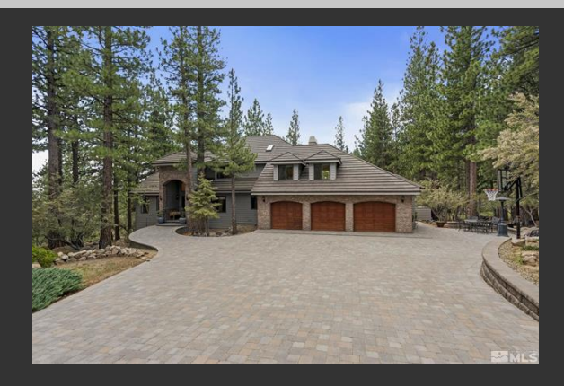
Galena Forest Estates 100 Yellow Pine Circle Price: $1,795,000