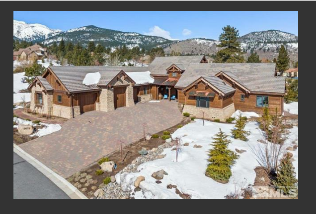
Montreux 5675 Alpinista Circle Price: $3,255,000

With radiant heat flooring, a new 2023 roof, partially radiant heat paver driveway, remodeled baths, gas fireplaces, hardwood stairs, & an upgraded HVAC system, no expense has been spared to ensure optimal efficiency & luxurious living. Indulge in modern living with extensive storage access,