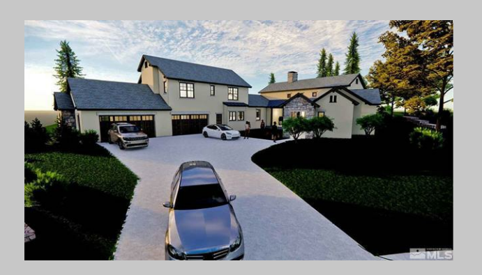
Montreux Address: 5192 Bordeaux Court Price: $ 2,950,000

The vaulted ceiling in the master bedroom stretches both to the east and west - offering stunning views of the valley sunrise and the Mount Rose sunset. Sit by its fireplace while sipping a glass of wine and take in the views.