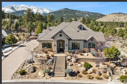
Montreux 16955 Salute Court Price: $3,789,000

MLS# 240003169 One of Montreux's finest custom homes. Rare single-level showcases quality & smart design. Large windows & open great room provides a feeling of modern warmth. Upgrades include Wolf appliances, Restoration Hardware lighting, Lutron home automation, custom outfitted closets & much more. With 4 BR suites, 2 comfortable offices & a 3.5 car garage. A private courtyard with an exquisite brick wine room, 1000+ bottles.