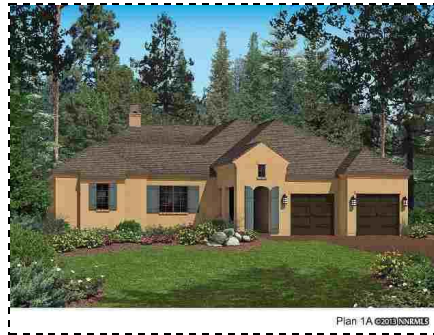
Creekside Manor 6573 Champetre - $2,599,000 - Maintenance free. MLS 1300092C 2 Story, 6,078 ft, 4 bedrooms, 4 1/2 bathrooms, 2 car garage

Other floor plans and models available to build to suit