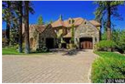
"Parc Foret" 20705 Pomerol Drive - $915,000 2,873 sq ft 3 bedrooms, 3 1/2 bathrooms. MLS 130002684

Other floor plans and models available to build to suit