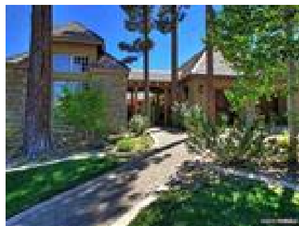
Cottage: Maintenance free on the 18th fairway. Location, location, location. On the ridge with fantastic views of Slide Mountain and Mount Rose, one of a kind! $1,500,000 3 bedrooms, 2 1/2 bathrooms, 3 car garage and theater room. Single st MLS 130006979