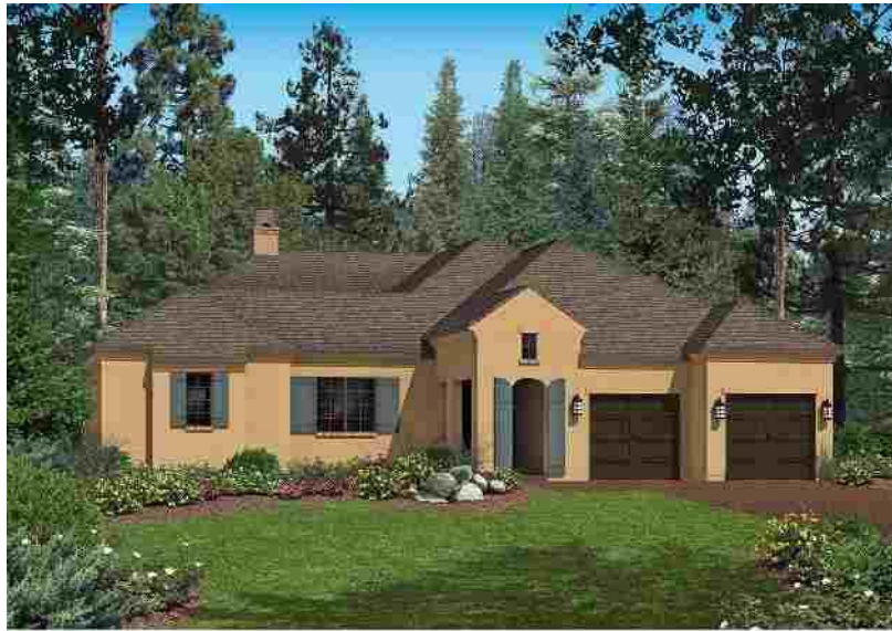
Plan 1A

2,873 sq ft home, 3 bedrooms, and 3 1/2 bathrooms. Other floor plans and models available to build to suit.