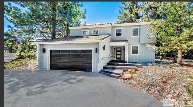
Galena Forest 455 Blue Spruce Rd $1,595,000

MLS# 240003169 One of Montreux's finest custom homes. Rare single-level showcases quality & smart design. Large windows & open great room provides a feeling of modern warmth. Upgrades include Wolf appliances, Restoration Hardware lighting, Lutron home automation, custom outfitted closets & much more. With 4 BR suites, 2 comfortable offices & a 3.5 car garage. A private courtyard with an exquisite brick wine room, 1000+ bottles. Backyard is fully fenced w/ pet- friendly turf & fire pit. Located near Montreux's gated entry. Located in the highly desirable gated Montreux Golf & Country Club community. Ideal location, 20 mins to the Reno-Tahoe Int'l Airport, 15 mins to Mt. Rose Ski Resort, and just a short 30-min drive to beautiful Lake Tahoe. This custom home is a true