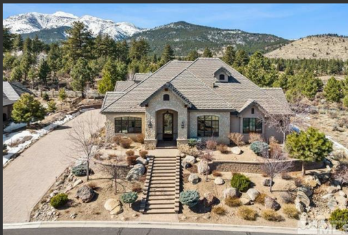
Montreux 16955 Salute Court Price: $3,789,000

MLS# 240003169 One of Montreux's finest custom homes. Rare single-level showcases quality & smart design. Large windows & open great room provides a feeling of modern warmth. Upgrades include Wolf appliances, Restoration Hardware lighting, Lutron home automation, custom outfitted closets & much more. With 4 BR suites, 2 comfortable offices & a 3.5 car garage. A private courtyard with an exquisite brick wine room, 1000+ bottles. Backyard is fully fenced w/ pet- friendly turf & fire pit. Located near Montreux's gated entry. Located in the highly desirable gated Montreux Golf & Country Club community. Ideal location, 20 mins to the Reno-Tahoe Int'l Airport, 15 mins to Mt. Rose Ski Resort, and just a short 30-min drive to beautiful Lake Tahoe. This custom home is a true