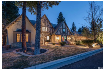
Montreux 20540 Latour Way Price: $ 2,899,900

MLS #220003368 Luxury Mountain Modern meets French Chateau. This Former Les Maisons model home is located in the coveted Montreux gated community and Country Club, home to Northern Nevada's only Championship Jack Nicklaus Signature golf course. Boasting beautiful exposed wood beams, soaring ceilings, gorgeous well maintained hardwood floors, and double-pane wood framed windows, this home is a masterpiece. Enjoy the tranquil view of the HOA maintained common area, offering walking trails, a stunning water feature, and dry creek.