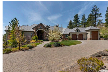
St James 520 Mount Mahogany Price : $ 4,380,000

MLS #220003368 Luxury Mountain Modern meets French Chateau. This Former Les Maisons model home is located in the coveted Montreux gated community and Country Club, home to Northern Nevada's only Championship Jack Nicklaus Signature golf course. Boasting beautiful exposed wood beams, soaring ceilings, gorgeous well maintained hardwood floors, and double-pane wood framed windows, this home is a masterpiece. Enjoy the tranquil view of the HOA maintained common area, offering walking trails, a stunning water feature, and dry creek.