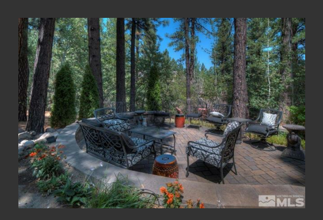
Montreux 5223 Nestles Court $4,200,000 Pending

Newly built, on Montreux's 11th green, this single level custom "Chalet" offers the perfect balance of indoor/outdoor living with mountain modern style. Quality abounds w/ ICF construction! Unobstructed golf, Mt. Rose & valley views. Chef's kitchen with topof-the-line appliances (SubZ & Bosch). Open floorplan with 3 BR suites + office. Primary suite with large linear fireplace, heated bath floors, 2 walk-in closets, steam shower & adjacent fitness center/flex space. The backyard is an entertainer's dream! Enjoy the expansive views of the Sierra Mountains & the famed Nicklaus golf course