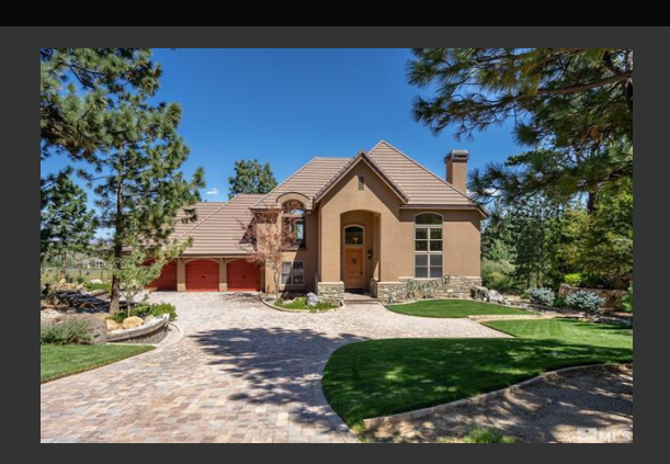
Montreux Address: 5740 Dijon Circle