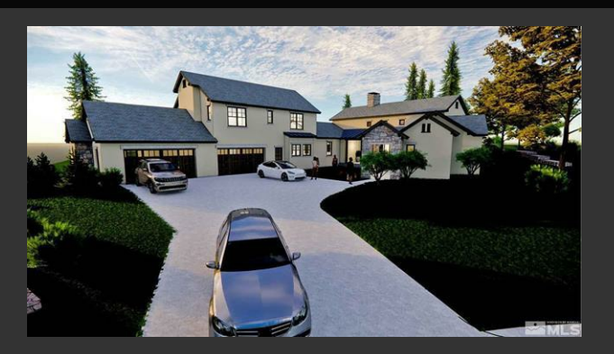
Montreux Address: 5192 Bordeaux Court

Montreux - Patio views that seem to stretch forever, all within the secure gates of Montreux. Picture windows in the living room look westward to capture the sunsets over Mount Rose. Stunning views out every window with nearly an acre of land that backs to a 70 acre pasture and HOA common areas. Neighbors are unseen from your patio - only privacy, pastoral views and forested beauty. Apple trees, peaches, raspberries and a raised garden makes this home into a homestead.