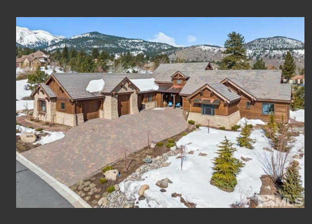
Montreux 5675 Alpinista Circle Price: $3,400,000