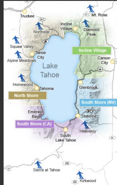
SURROUNDING SKI RESORTS