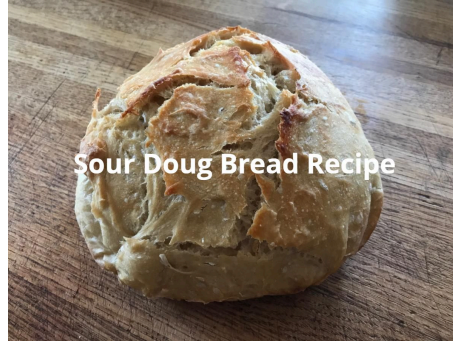
Sour Doug Bread Recipe...Easy