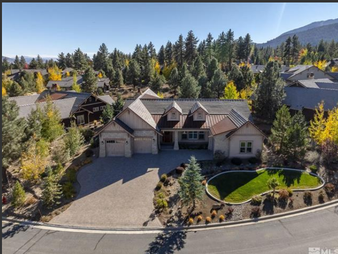
Montreux 5650 Alpinista Circle Price: $2,550.00