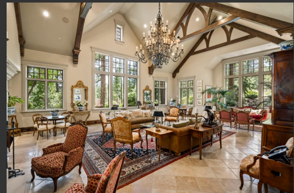
Montreux 6025 Lake Geneva Drive $8,200,000 Video of home.

Welcome to your luxurious Mountain Modern retreat at 5650 Alpinista Cir, nestled in the coveted Chalets of the exclusive Montreux community in South Reno. This elegant single-family residence, a 3308sqft single-