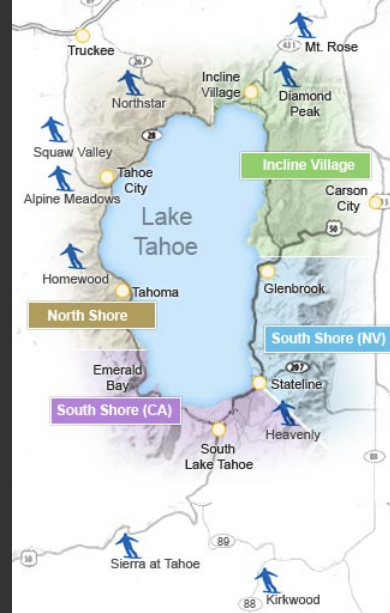
SURROUNDING SKI RESORTS