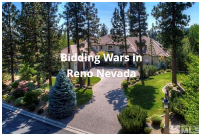
Bidding Wars in Reno Nevada