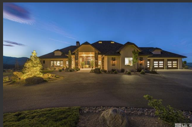
St James Village Gated Community

Experience the carefree lifestyle of a coveted Montreux "Cottage". This quality home offers low-maintenance, lock-and-leave exteriors & a short stroll away from the Montreux Club House & amenities. Serenity meets outdoor entertainment with a private front courtyard &