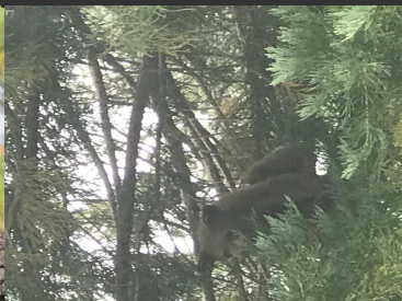
Bear Cub up a tree in my garden