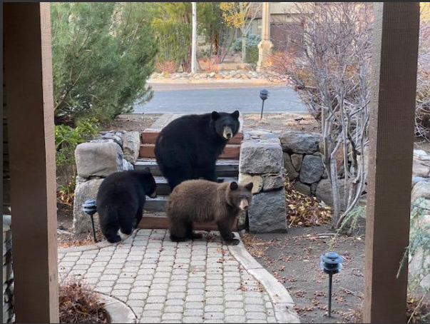
Bear in my garden video

For more information on buying or selling a home, please contact me at louise@montreuxreno.com or call me at 775-750-1901.