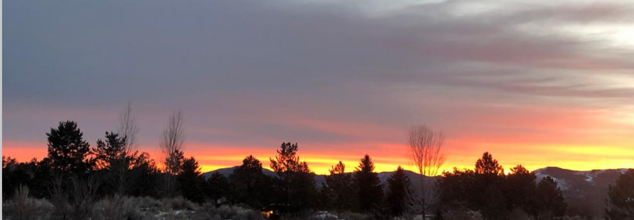
Mount Rose at Sunrise