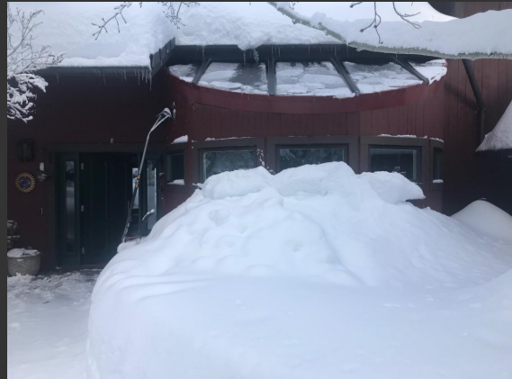
Day 3 of snow storm...4 feet

Beginning October 1, Purchase a New Golf Membership and Don't Pay Any Dues until April 1