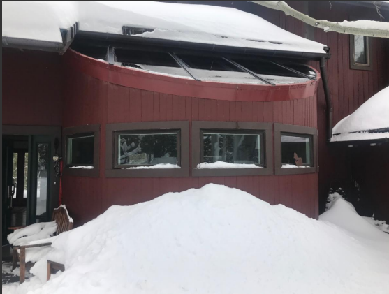
My House with 2 feet of snow.