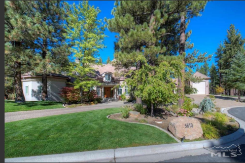
Montreux Golf & Country Club 5610 Mont Blanc Court Price: $4,900,000

Three fireplaces provide a warm and welcoming ambience. An office opens up to a veranda and the gourmet kitchen featuring Thermador appliances that will satisfy any cook. All this and partial mountain views on a half acre lot. THE LOT WITH APPROVED PLANS AND ALL PERMITS IS AVAILABLE FOR $385,000.