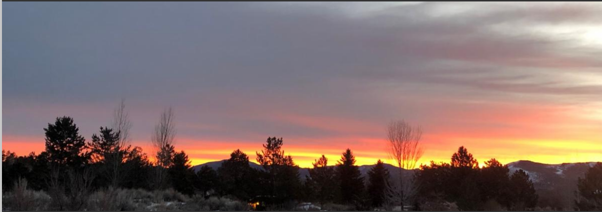
Mount Rose at Sunrise

Inventory in Montreux and the surrounding area continues to be almost none existent. Hopefully as Summer approaches more homes will come on the market.