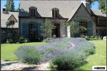
70 Bennington Court St James Village Price: $ 2,990,000

a Lakecrete built home, utilizing insulated concrete form construction, beautiful finishes, and details throughout. This home features plenty of space to move around in and a spectacular 2,000 bottle wine room/cellar! There are plans available to add an additional 2 car garage to the property. Champetre presents a stately entrance with its stone exterior and gated courtyard. Offering a second master suite and separate casita with a full bath make this wonderful home not only beautiful, but also highly versatile.