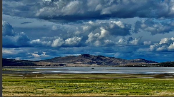
Washoe Lake adds beauty to the area