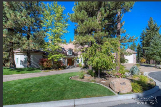
Montreux Golf & Country Club 5610 Mont Blanc Court

3 Bed , 3.5 bath and a bonus loft with a mountain view that can be used for pure entertainment or another guest room. This luxurious single story home (unless you want to go upstairs to the loft/game room) has an open floor plan making for great entertaining. The home features mountain views with hickory hardwood custom flooring throughout each room. The house was built and placed to receive natural sunlight throughout the day with a stunning forest and mountain view to boot. The sellers have an area located northeast in which you can see sunsets, mountain views, and all that nature has to offer, with a natural wood burning fire pit to enjoy the most relaxing of nights. That's not all, the backyard has a custom built bbq kitchenette, with a flat screen tv and a gas fire pit to get cozy by for those that love to entertain or have a quiet evening in with the family.