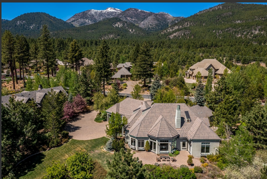
5800 Lausanne Drive Montreux Golf & Country Club

at Montreux Golf and Country Club. Enjoy the mountain views and flowing creeks. This is the perfect home for family and entertaining with gourmet kitchen, fully equipped built in BBQ, large wine cellar, game room, large theater room, outdoor fireplace and top of the line large screen outdoor TV. The large Master Suite is its own private retreat for the homeowner with fabulous fireplace, sitting area, and view capturing balcony. Master bath has beautiful granite, large tub, in mirror tv, heated floor, and oversize master closet. The 4 car plus garage is perfect for the car enthusiast. The home boasts all high end finishes with custom cabinetry, hardwood floors, iron work, and stone. A top of the line sound system throughout provides an incredible listening experience paired with a Crestron system allows simple hand held control. Bonus room allows perfect space for a workout area or playroom. Montreux membership is included with home, Buyer is to pay transfer fee.