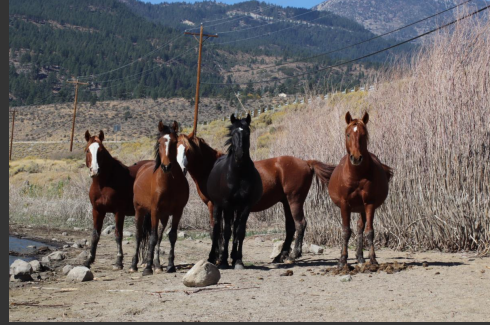
Wild horses at Washoe Lake